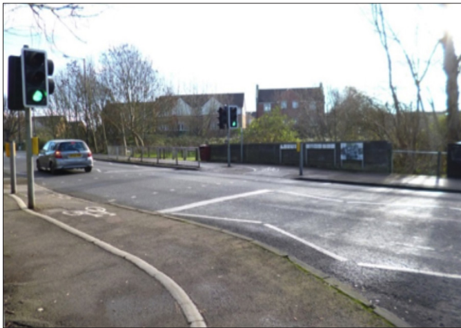
We propose to change existing crossing to a Toucan and resurface the footway areas on either side.