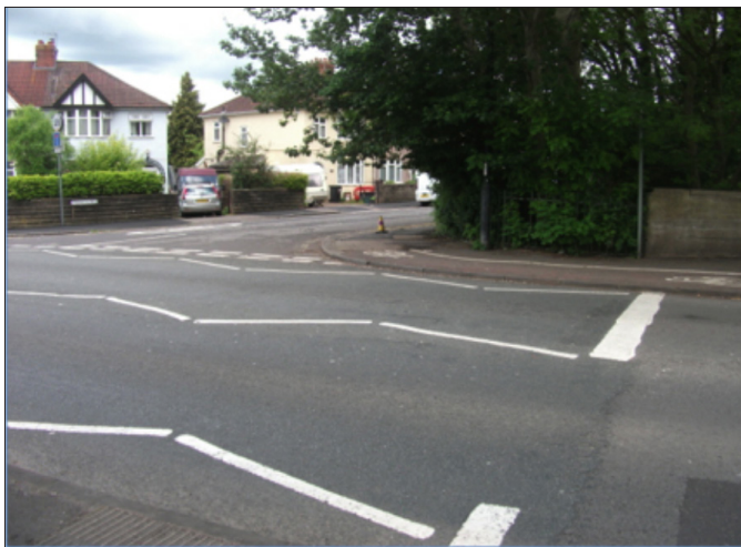
Minor footway widening at the corner of Francis Road will give more space for users.