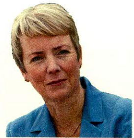
Karin Smyth Labour MP for Bristol South

House of Commons Westminster London SW1A 0AA 0117 953 3575 karin.smyth.mp@parliament.uk