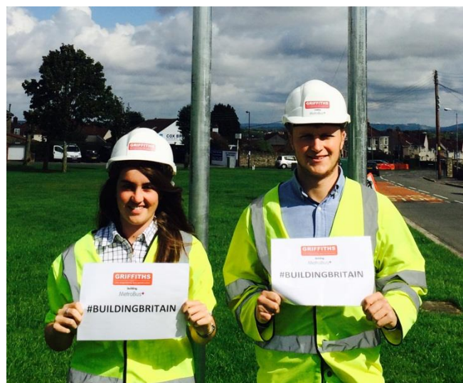
Students on placement on the South Bristol Link scheme