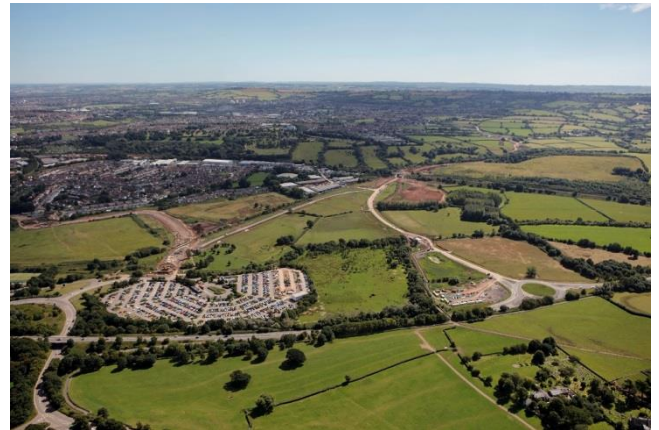
Aerial view of the South Bristol Link and the new A370 roundabout and Long Ashton Park and Ride

Alun Griffiths (Construction) Ltd were able to use their in-house material recycling capability to process material excavated during the works for Bristol Airport's new terminal extension and reuse it for the South Bristol Link.