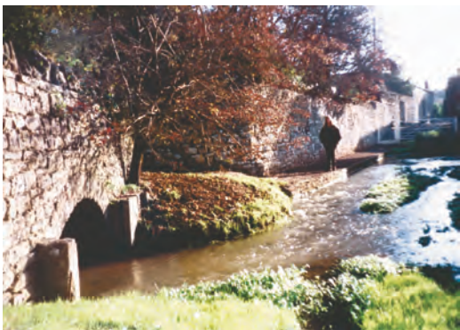
Bridge over river at Stockwood Vale