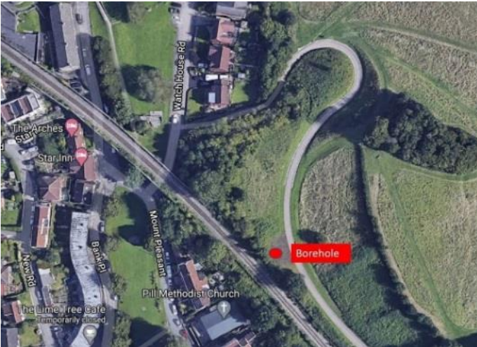
Watchhouse Hill Image 1

The red dots in the following images show where our weekday and weekend ground investigation work will take place at Watchhouse Hill (image 1) and Hardwick Road (image 2) Mount Pleasant (image 3) and Avon Road area (image 4).