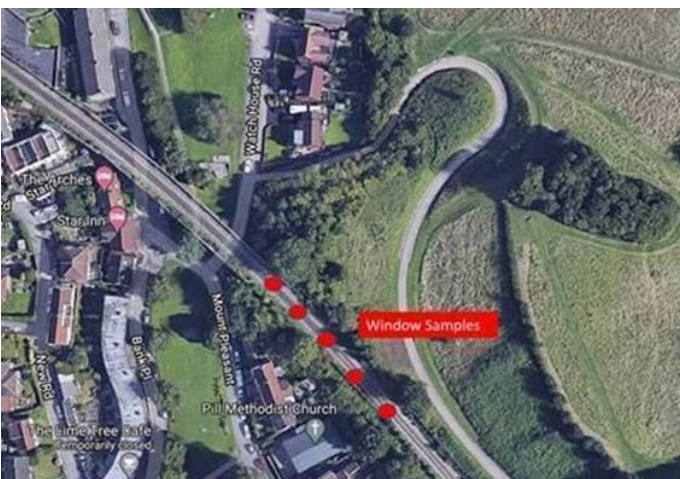
Mount Pleasant Image 3

If you are thinking about doing any work on or near the railway infrastructure, please contact us so we can provide expert advice and assistance