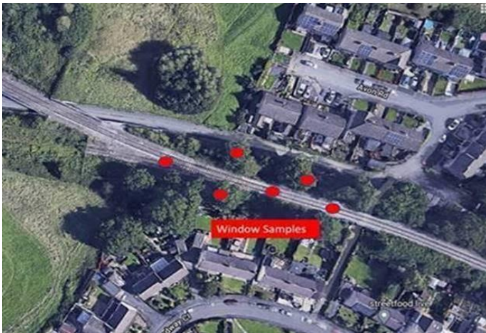
Avon Road Area Image 4

As part of these works, we need to establish a partial closure of Hardwick Road. We will write separately to local residents to advise the dates for the closure and offer the opportunity to answer any questions or concerns. During the closure we will request that the areas outlined in red below can be left clear of vehicles, so that our teams can safely carry out work.